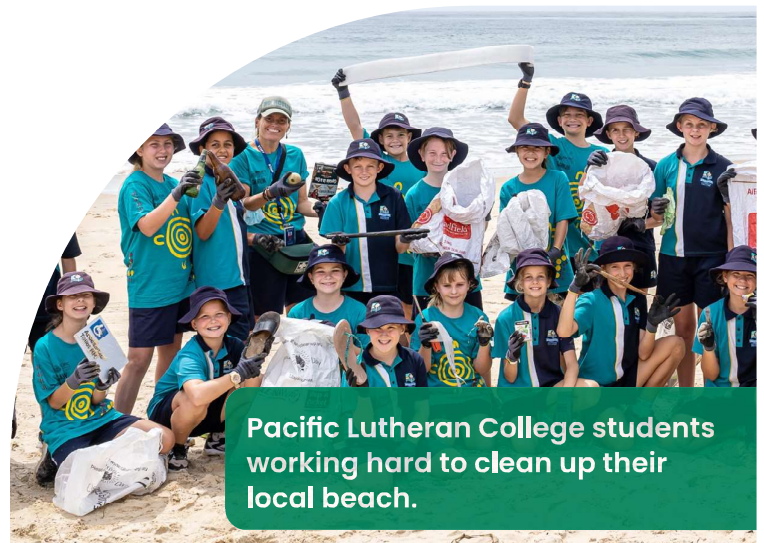
Pacific Lutheran College students working hard to clean up their local beach.

For any questions or enquires on Wave of Change, please contact waveofchange@containersforchange.com.au .